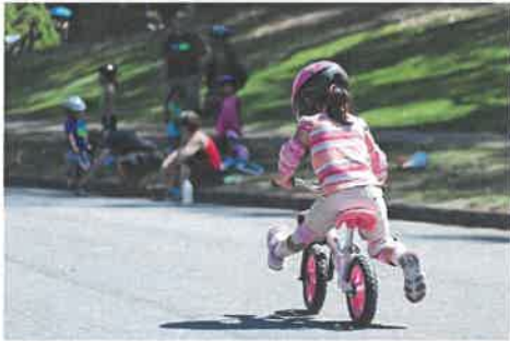
Pathways for Learning