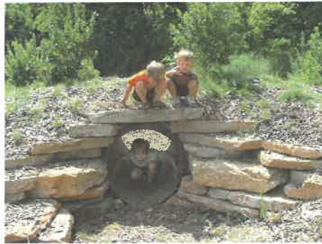
Nature Play Tunnel