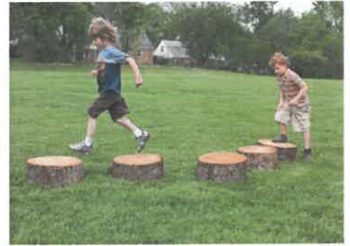
Nature Play Stepping Stumps