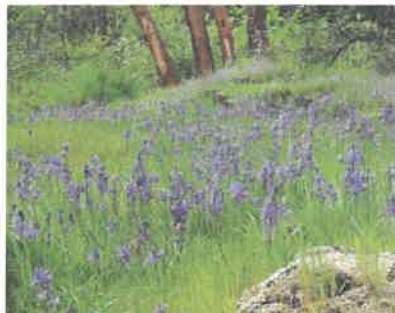
Natural Area Planting