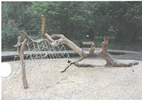
Nature Play Climbing Structure