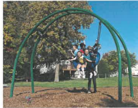
Structured Play Element