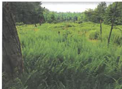
Native Wetland Planting