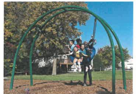
Diverse Structured Play