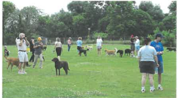
Fenced Dog Park