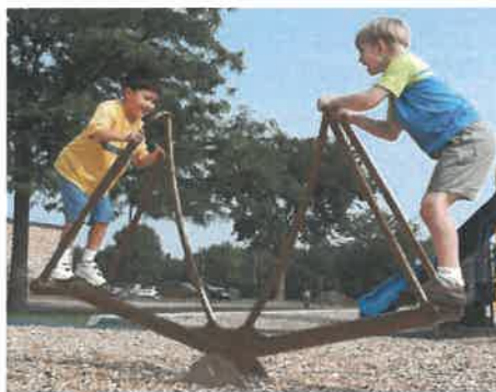
Structured Play Element