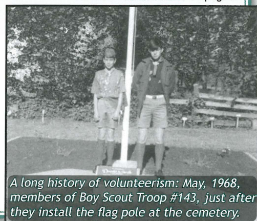
A long history of volunteerism: May, 1968, members of Boy Scout Troop #143, just after they install the flag pole at the cemetery.