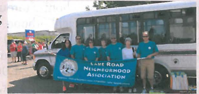
LAKE RD. VOLUNTEERS AT LOURDES TRIATHLON

Numerous studies show volunteering, regardless of the reason behind it (such as peer-pressure, self-interest, or purely altruistic), increases a person's well-being. And the study I recently read showed that it actually increases longevity! You can do good deeds and live longer! Attend your next NDA meeting and see how you can help out others and increase your life span.