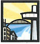
Exhibit 1: Fee Explanation