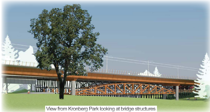
View from Kronberg Park looking at bridge structures

The multi-use structure will directly link Downtown Milwaukie with Neighborhoods south of Kellogg Creek and McLoughlin Boulevard, including the Island Station and Oak Grove areas.