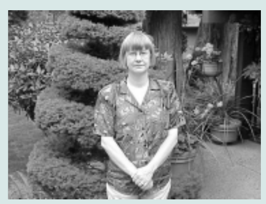
Dolly has been a resident since 1978.

A testament of these improved relations seems to be the influence the Neighborhoods have had in shaping the transit alternatives proposed by the South Corridor Study. Dolly was influential in Light Rail's defeat in 1998, and has been just as influential in trying to create a transportation system that benefits the City and region.