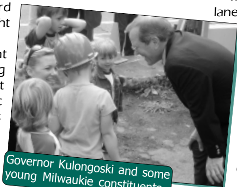
Governor Kulongoski and some young Milwaukie constituents

Milwaukie's Riverfront Board is currently refining a pair of concept plans that will be taken to the public as part of a vigorous outreach effort. Please check future editions of The Pilot to learn how you can voice your opinion.