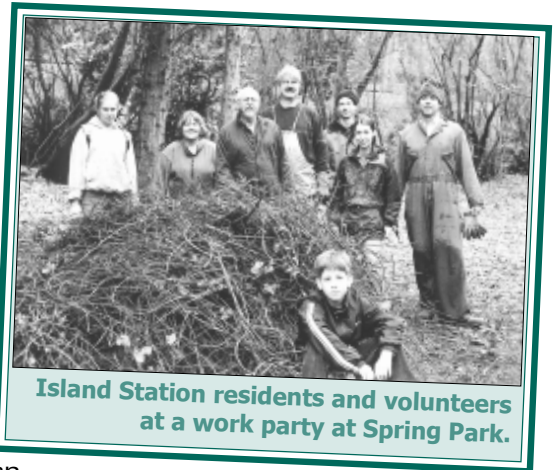
Island Station residents and volunteers at a work party at Spring Park.

ter Plan, we will launch two working groups in the next few weeks to address specific issues relating to Spring Park and Elk Rock Island: designating a parking area (eight potential sites have been identified), and design of interpretive signage. If you are interested in serving on either group, please call me at (503) 353-1825.