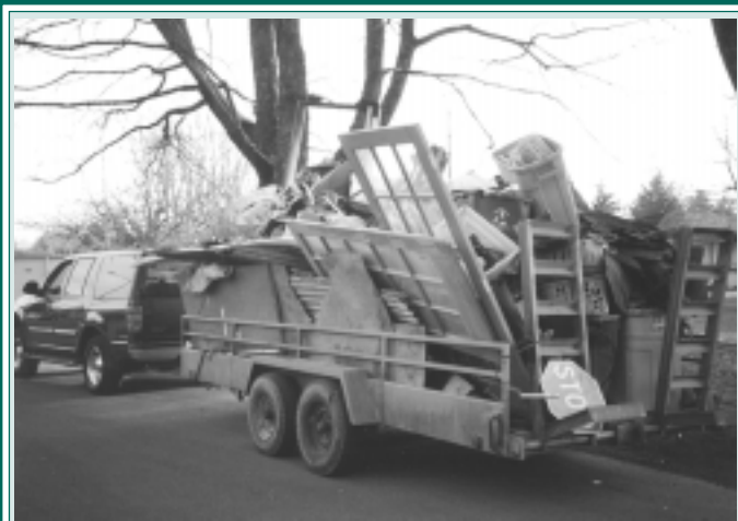
Take advantage of the Down to Earth Day collection event, like this resident did last year, on May 4, 2002. Linwood Elementary is one of three City drop sites.