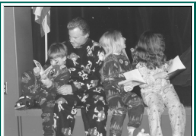
Ardenwald Elementary held its Family Reading Night in February. Parents and children alike read in their pj's

The three sites would be: Linwood Elementary, Lewelling