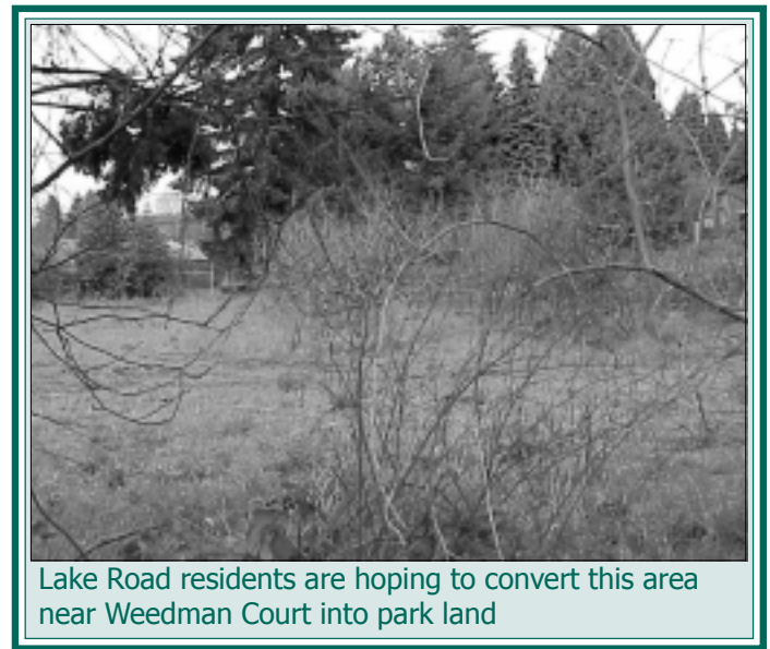
Lake Road residents are hoping to convert this area near Weedman Court into park land

Thank you for your valuable contribution and participation in making and keeping our community the best!