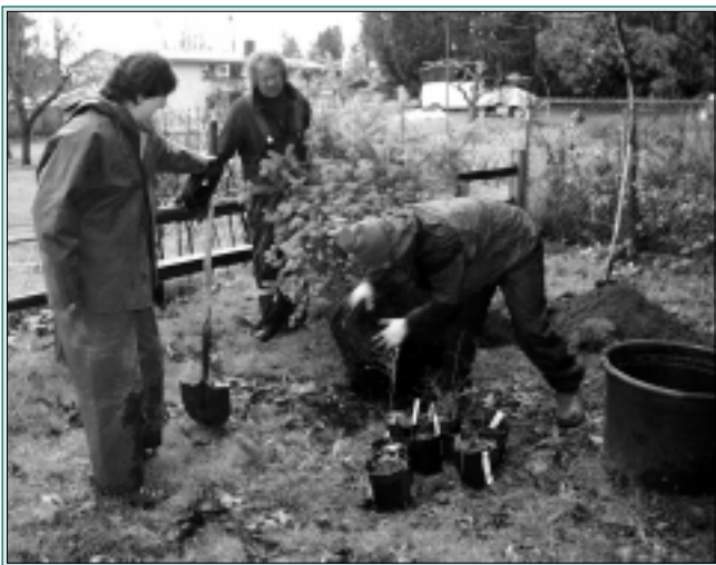
Hector Campbell residents at a recent work party.