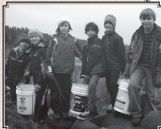
Fourth grade students from the Waldorf School took to Milwaukie's Riverfront on Martin Luther King Day to honor the Holiday and spurge up the area through service.

a chance to change the whole philosophy of Milwaukie, to open us up for regional business, while at the same time, pushing for retention of the small town feel and livability we often claim is so dear to our hearts. Now, with the economy still in a funk, is the time to lay the basis for our future--let's all work together in a positive way to make sure it happens.