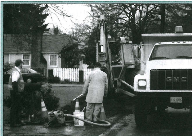
This work at 42nd Avenue and Howe Street will provide sidewalks and storm water system improvements.