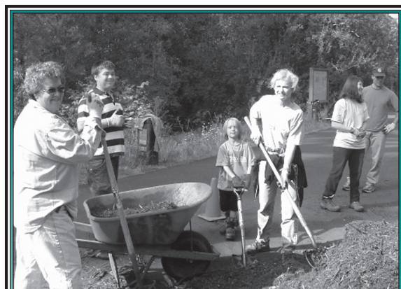
Volunteers were to gather at Tideman Johnson Creek Park for another work party on Dec. 1 st .

Afterthoughts: A projected NO vote by the Clackamas County Commission to use Community Development Block Grant funds to purchase the Balfour property would have saved many people a lot of time and angst. We do have