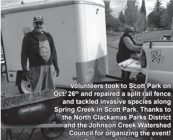
Volunteers took to Scott Park on Oct. 26 th and repaired a split rail fence and tackled invasive species along Spring Creek in Scott Park. Thanks to the North Clackamas Parks District and the Johnson Creek Watershed Council for organizing the event!