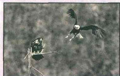
Nesting Bald Eagles at Jackson Bottom Wetlands Preserve