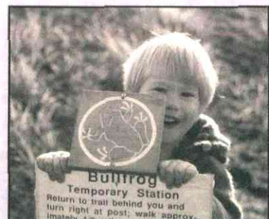
Having fun at Jackson Bottom Wetlands Preserve