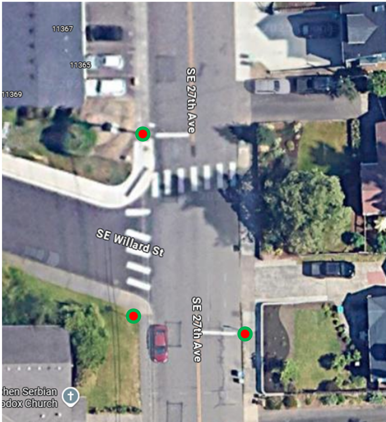
Figure 1: Site Map